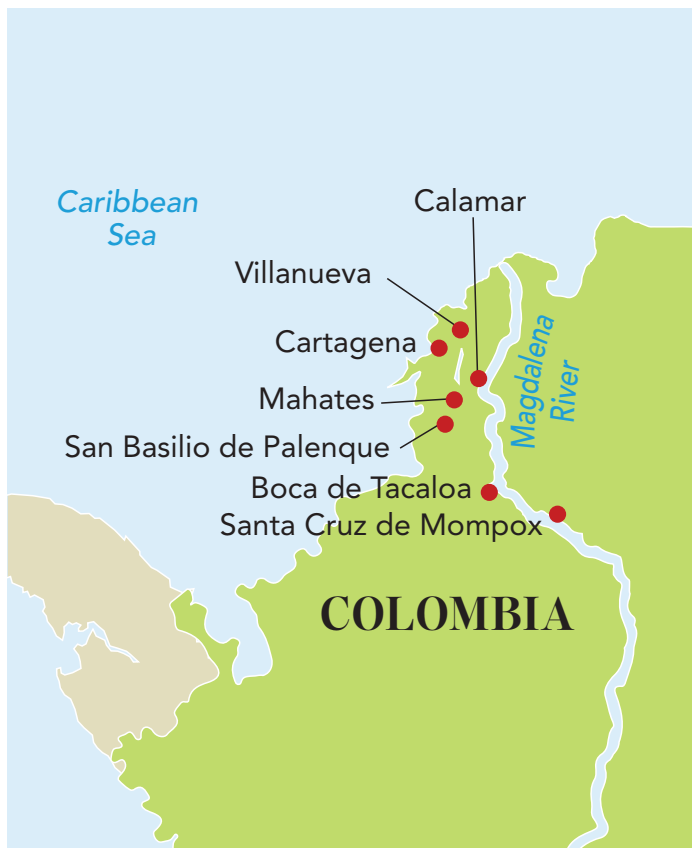
Map of the region

Go behind the scenes at a pioneering Cartagena institution that has given free arts education to vulnerable youth, watching young dancers trained in Afro-Colombian movement.