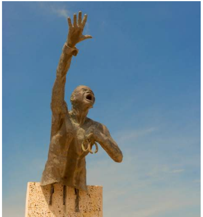
Benkos Biohó statue, San Basilio de Palenque

Meet community hosts for a special look at UNESCO-listed San Basilio de Palenque , the first free African town in the Americas. In 1603, Benkos Biohó, a Bantu king from present-day Guinea-Bissau, led escaped enslaved Africans to found this walled settlement; a Royal Decree in 1691 formally recognized its freedom.