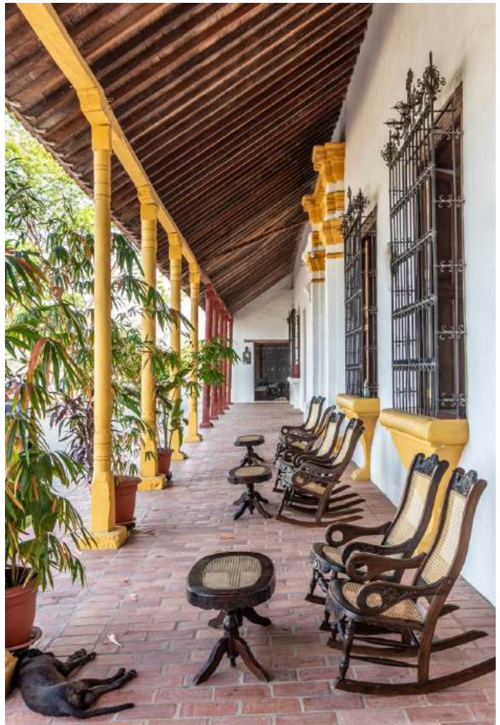
Colonial house, Santa Cruz de Mompox

Later, stop at the Casa de la Cultura to see historical exhibits and archives, followed by a guided tour of a private historical residence . This evening, gather for dinner on board.