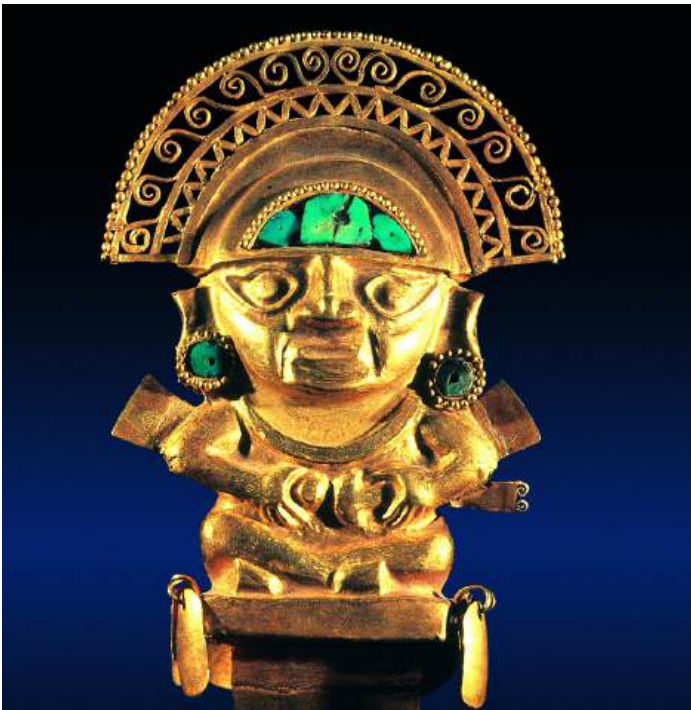
Museo del Oro Zenú, Cartagena

Enjoy lunch on board and take advantage of the ship's amenities as you continue cruising south, before arriving in Santa Cruz de Mompox , the UNESCO-listed town founded in 1537 as a Spanish gold depot. When the Magdalena shifted course in the mid-19th century, it bypassed Mompox entirely, freezing its 17th-century architecture in place.