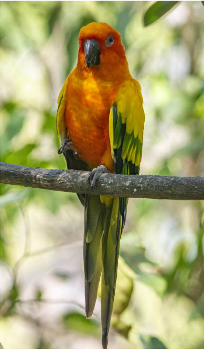
Parrot, Aviario Nacional de Colombia, Cartagena