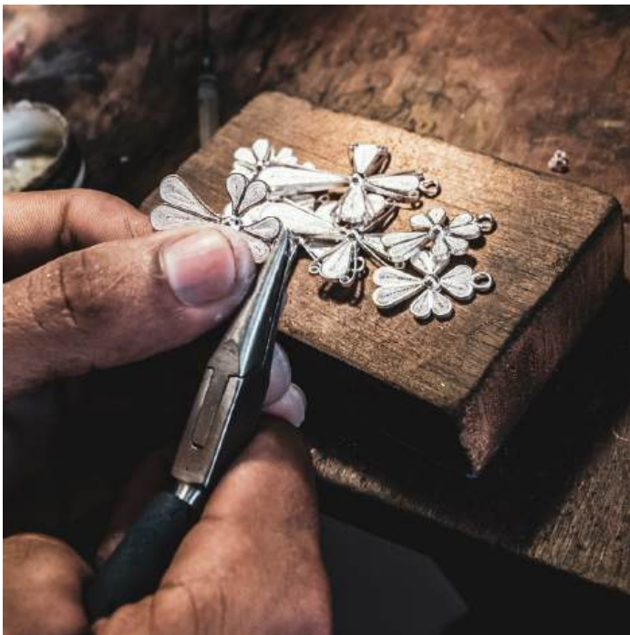
Filigrana momposina workshop, Santa Cruz de Mompox

After an afternoon cruising the river, arrive in Cartagena in time for sunset drinks on deck as the city comes into view. You may join an expert for an optional tasting of Colombian chocolates paired with locally crafted rums , learning the bean-to-bar and distillation processes. While docked in Cartagena this evening, gather for dinner aboard AmaMelodia .