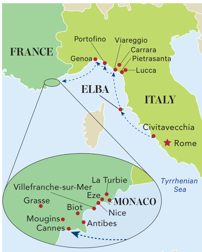
Map of the region

Experience the history and artistic heritage of the Côte d'Azur, featuring a guided tour of Monaco, the glittering Mediterranean principality, and optional excursions to museums such as the Musée Picasso, housed in a medieval château where the Spanish artist lived and worked.