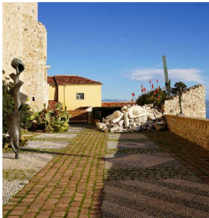
Musée Picasso, Antibes, France

From Villefranche-sur-Mer, venture to Eze and La Turbie , two hilltop villages. At Eze, climb to the Jardin Exotique to explore its collection of cacti and succulents while enjoying views over the