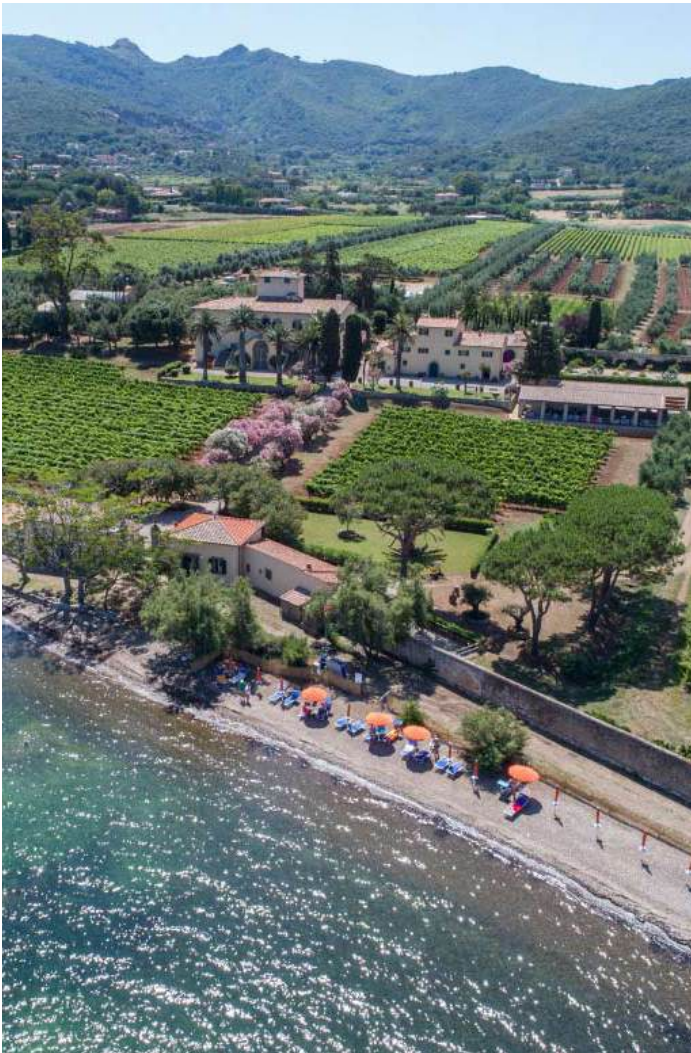
Tenuta La Chiusa, Elba

Then, enjoy a delightful visit to Tenuta La Chiusa and savor a medley of lunch bites during a wine tasting.