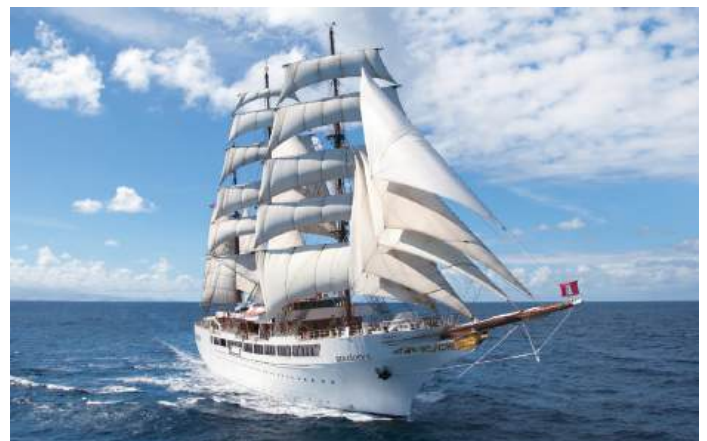
Sea Cloud II