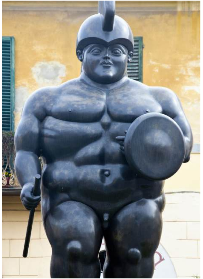
Il Guerriero by Fernando Botero, Pietrasanta, Italy