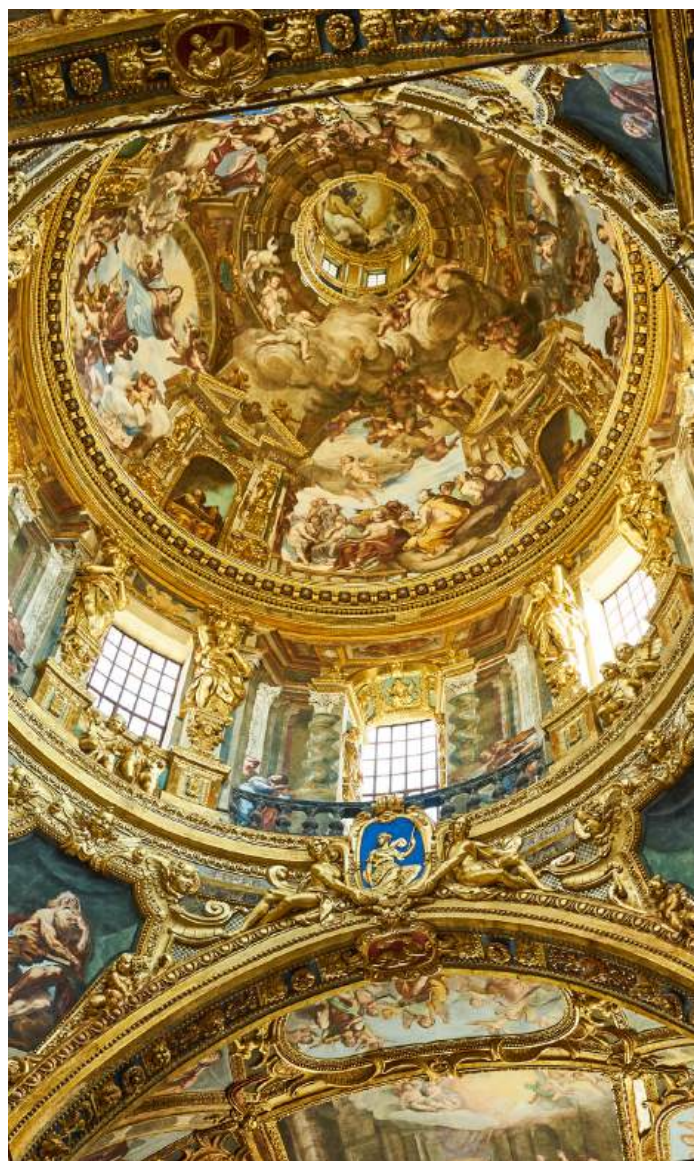
Basilica della Santissima Annunziata del Vastato, Genoa, Italy

Visit Villa del Principe , the 16th-century grand palazzo of Admiral Andrea Doria, and roam the Italian-style gardens that once hosted Emperor Charles V.