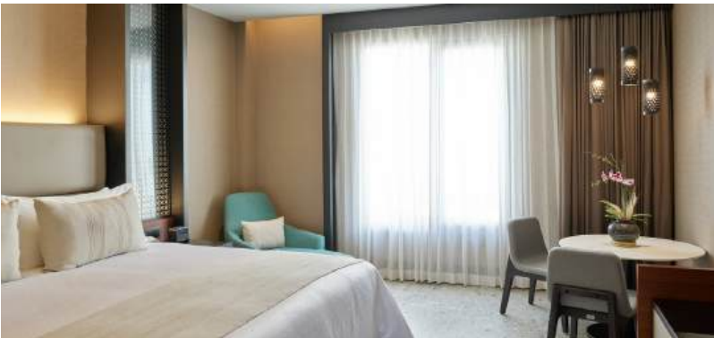
Grand Fiesta Americana (top) and Suite (above)