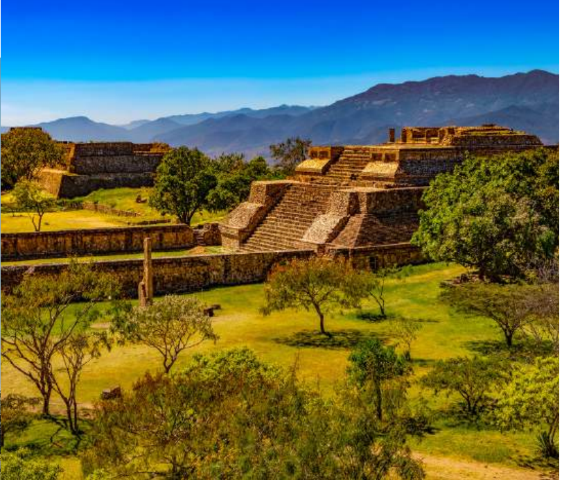
Monte Albán, Oaxaca