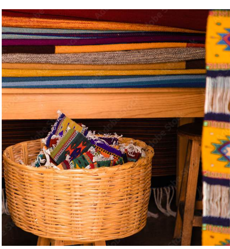
Teotitlán del Valle, Oaxaca

Transfer to the Oaxaca airport this morning for your flights home.