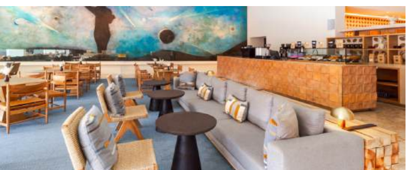
Camino Real Polanco México (top) and Café Tamayo (above)